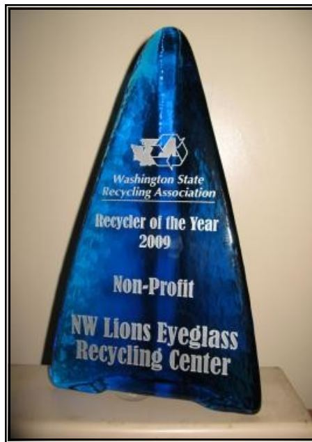
“The Blue Rock” NWLERC was named Washington State Recycler of the Year for 2009.