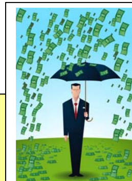
Lyell is standing by for your donation...